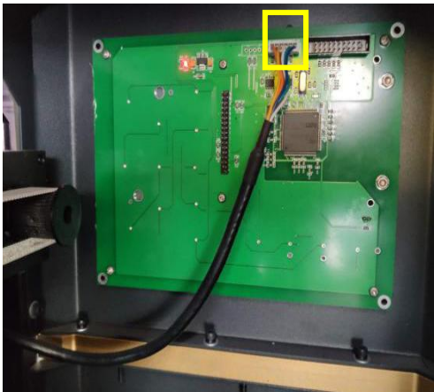
cable Connecticut on screen

1-1 Check the cables connection in good condition between screen and mainboard.