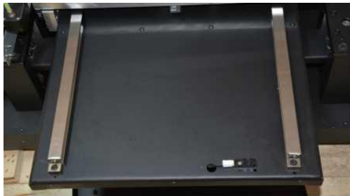
Front limit sensor for Y axis

Check the front limit sensor in Y direction is damaged. And sensor connector on sensor board(SY001) is good or replug it.