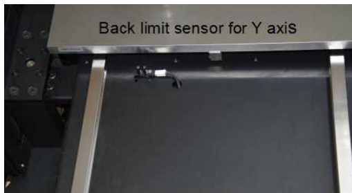
Back limit sensor for Y axis

Check the back limit sensor in Y direction is damaged. And sensor connector on sensor board(SY010) is good or replug it.